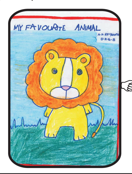
V. VISHRUTH (UKG-C)